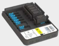
12 Port LCM DALI PS 97-MCC108-407 64mA (Source)