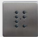
Scene Plate 97-125-202 15mA