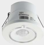
DALI Multisensor 97-321-SLPG325 6mA