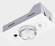
DALI Multisensor IT 97-315 10mA