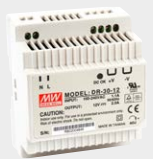
Control 3 PSU 97-C3-PSU LV supply for Processor

See Control3 Brochure for additional available components