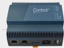
Control 3 Processor 97-C3CPU 1-8 Slices can be connected