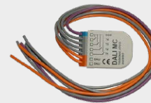
Switch Input 97-DALI-MC 6mA