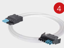
6 Pole 5 Core LCM to T LMM6-x5-NLFM6 (x) Lengths 1m to 12m LCM-T or LCM-Socket