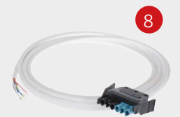
6 Pole 5 Core for LCM (Luminaire+)+x5-LMM6 (x) Lengths 1m to 12m LCM-Luminaire