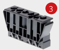
6 Pole Luminaire Socket (Luminaire)+97-166GEST06