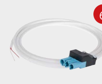
3 Pole 2 Core Sensor (DALI-Sensor+)-x2-NLFM3DA (x) Lengths 1m to 12m LCM-Sensor or T-Sensor