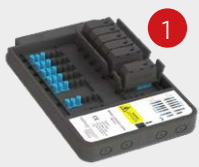
12 Port LCM 97-MCC10B