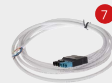
6 Pole 5 Core For T (Luminaire+)-x5-NLM6 (x) Lengths 1m to 12m T-Luminaire