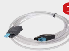
6 Pole 6 Core Extender NLMM6-x5-NLFM6 (x) Lengths 1m to 12m T-T or T-Socket