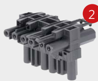
6 Pole T Piece 97-166GVT06