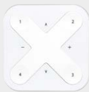
Scene Plate 97-XPRESS Battery - 2 years